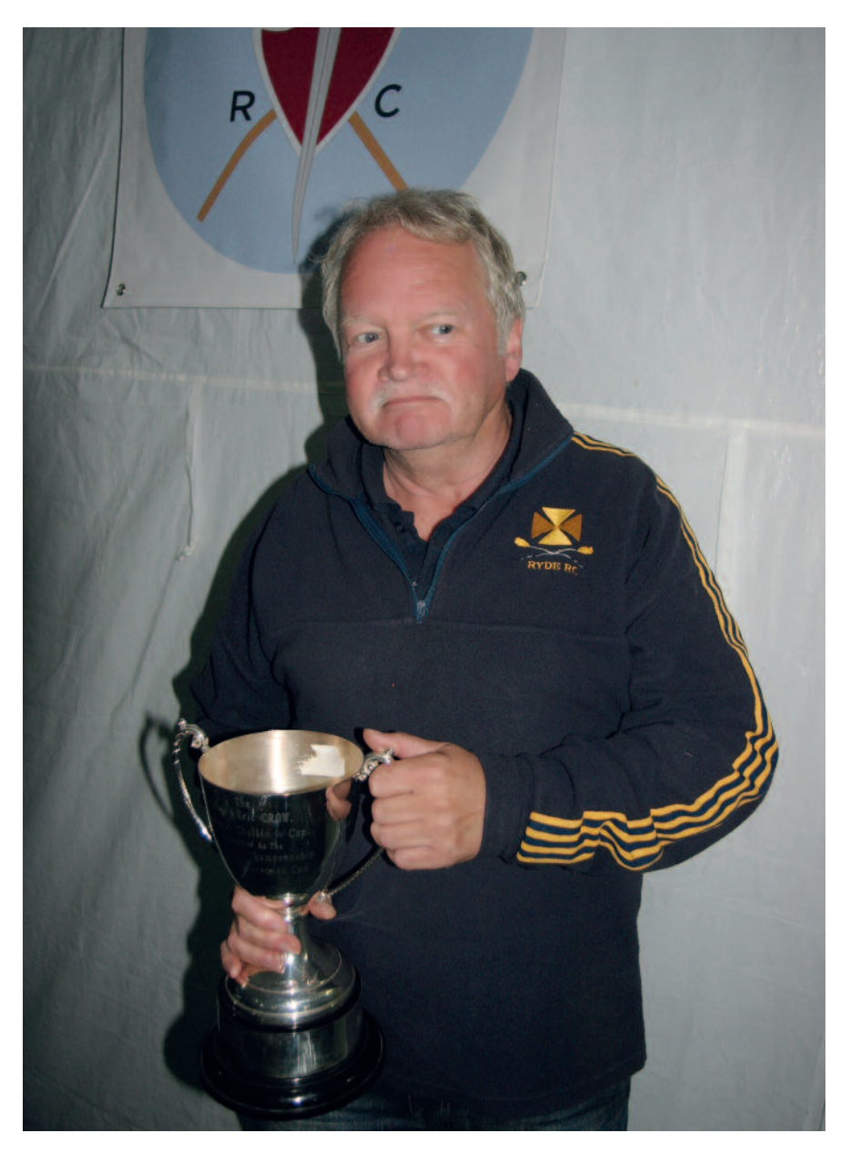
Do I have to clean the cups as well?

For contact details, please refer to the directory on page 70