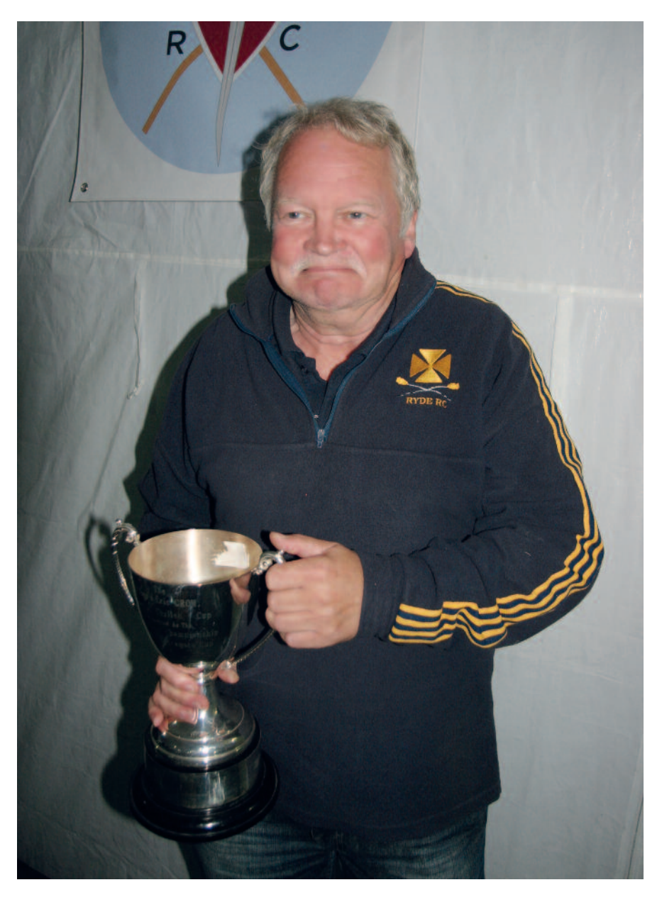
No ... Thank goodness for that!